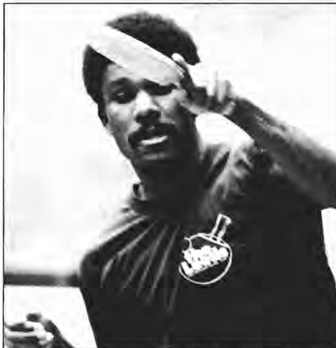
Desmond Douglas, the Commonwealth mens singles champion, Isle of man, 1985.

In the past four years, several Commonwealth countries have acquired professional coaches, some Chinese, which also reminds us that Hongkong are certain to provide some of the strongest opposition for England whose chance of success with five men coming up with results of world-beating stature, cannot be much brighter.