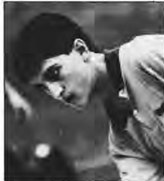
Matthew Syed is one of the best defenders in Europe. He beat the French ace Jean-Phillippe Gatien in France in the European cup, but are defenders threatened with extinction?

The match as a whole was in total contrast to the build up which was full of aggravation and ill feeling, but on the day it was full of everything that is good in the game of table tennis, played